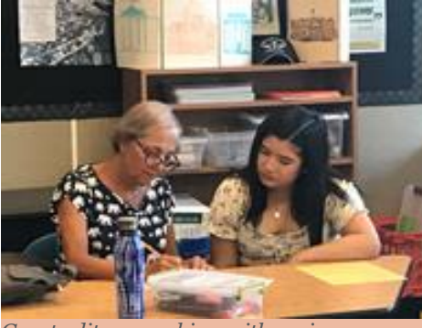
Guest editors working with seniors on drafts of their college essays

Salt Lake Center for Science Education 1400 W Goodwin Ave Salt Lake City, UT 84116 801 578 8226 britnie.powell@slcschools.org www.slcse.org