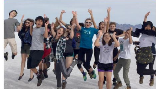
SLCSE as a high school, please share an invitation to our Open House on January 23<sup>rd</sup> from 5pm until 7pm.